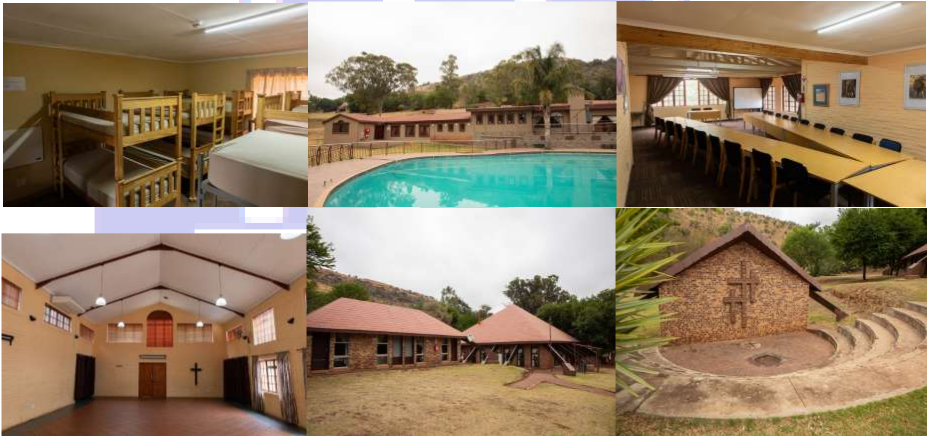
Figure 6: Photos Downloaded on 08 Jan 2025 from the Website of Achterbergh Camp & Conference Centre ( https://achterbergh.co.za/ ).

Several amenities may be available at Achterbergh Camp Site Self-catering facility ( west of Joburg ) at sleeping rates to be paid by members who will use their own money to pay for accommodation and to buy their own food when they volunteer to attend 6 Day Non-compulsory Optional Face to Face Residential Phase 5 Induction. Provided that we successfully negotiate for reduced rates , preferably at Achterbergh ( west of Joburg ), the sleeping rates may start from as low as R120 person per night. The said amenities preferably at Achterbergh ( west of Joburg ) may include, ( but not restricted to ), Bunk Beds, beddings, Self-catering Kitchen, fridges & deep freezers, WiFi, Laundry with washing Machine, Pool Table, Jumping Trampoline, over 150m 2 of artificial grass for play, picnic, relaxation & outdoor prayers, 2 Braai areas, DSTV, Emergency Electricity Generators, Emergency Water Reservoir Jojo Tank, Electric Fence of Brick Wall, Armed Response Panic Button, Emergency Ambulance Assistance, Reserve Parking, Boardrooms etc.,