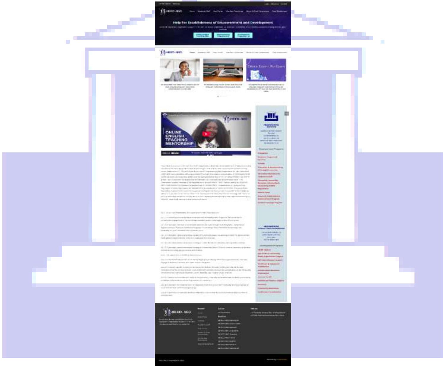
Figure 2: Screenshot showing where you may primarily click on rolling pictures on the newflash of our website www.heed-ngo.org.za to register online and later write your Ethics Exam/Re-exam for free at 19h00pm on 6 th day of any month after you earlier clicked on a rolling picture on the newflash of our website www.heed-ngo.org.za to download your ethics Study Guide and after you thoroughly and completely prepared for writing your online ethics Exam/Re-Exam noting that our website is, inter alia, our Learning Management System (LMS).